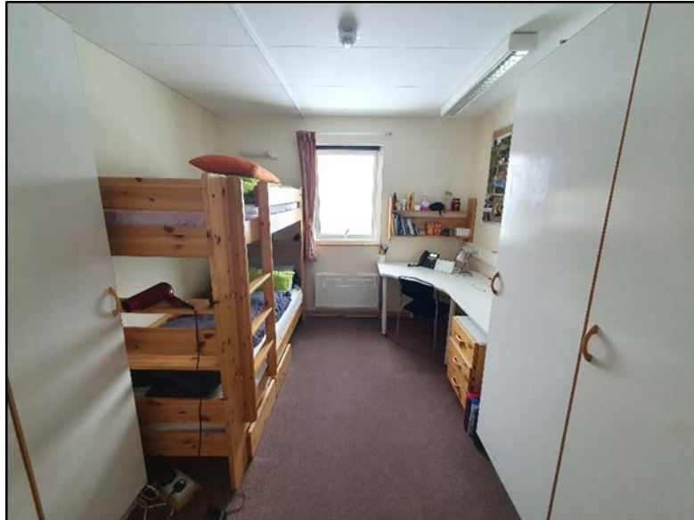
A typical KEP pitroom with bunks, desk, cupboards and en-suite shower & toilet. Over winter you will normally have a room to yourself.