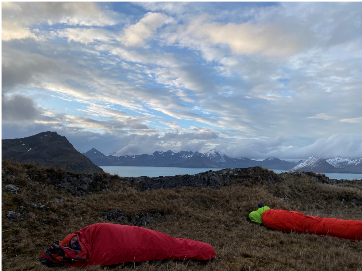
Bivvyng near Maiviken