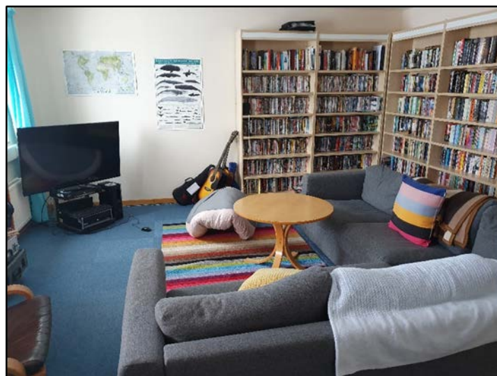
Screen 2 has a good supply of DVDs and books.

There is an extensive selection of books, music, movies and TV programmes on station and you'll never be short of something new to discover. However new additions, especially new releases, are always welcome. We get regular releases of a range of magazines, though all a year behind their publishing date. New reading material is popular at smoko.