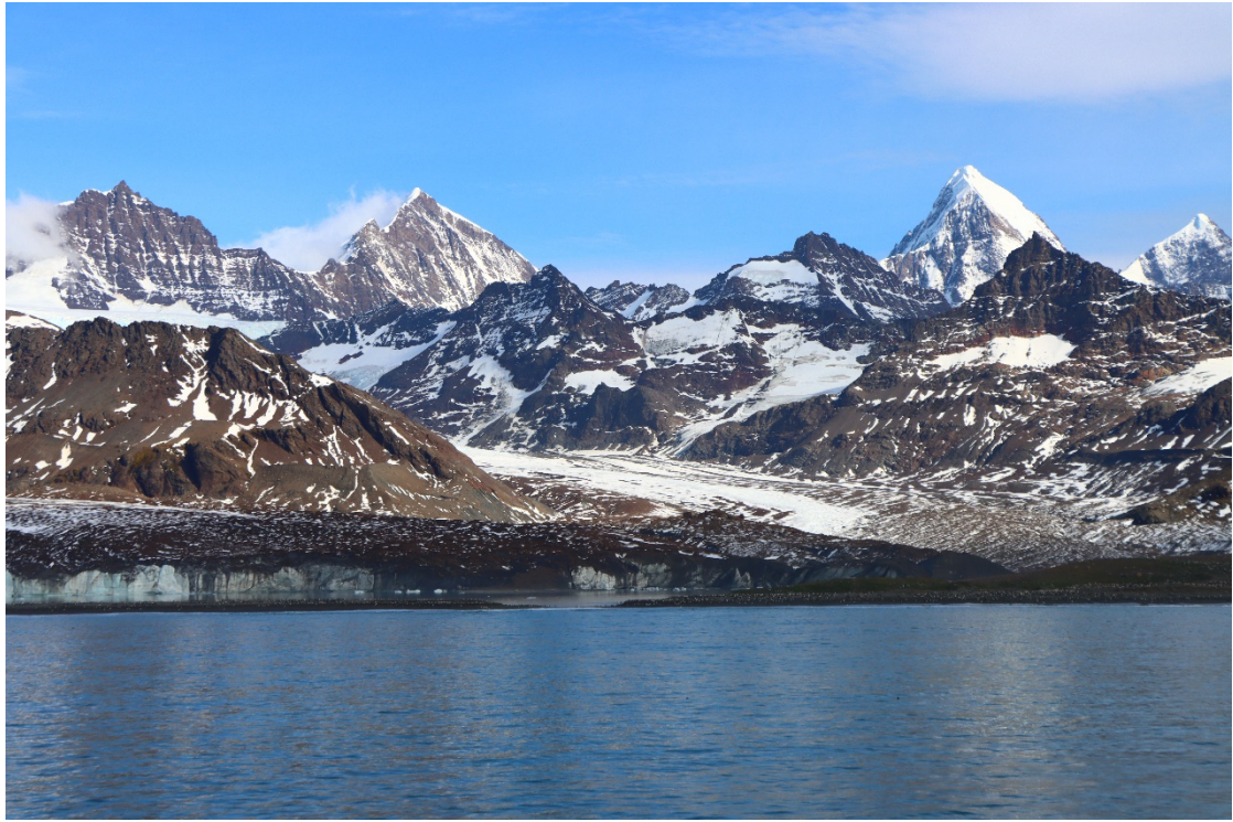
More of the beautiful South Georgia scenery