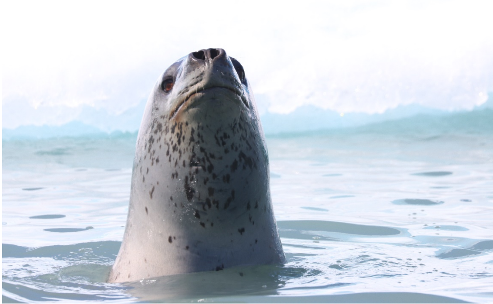
Leopard Seal by an ice berg

The scenery and wildlife at South Georgia are spectacular. Many people spend a lot of money on a variety of cameras and it's common to wish they'd brought more rather than less, however there is no need to go crazy and spend excessive amounts.