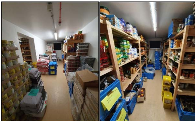
Well-stocked KEP food stores

no doubt discover a whole new range of culinary ideas. Vegetarians/Vegans are well catered for too. If cooking isn't your thing – do not worry! It really will be fine.