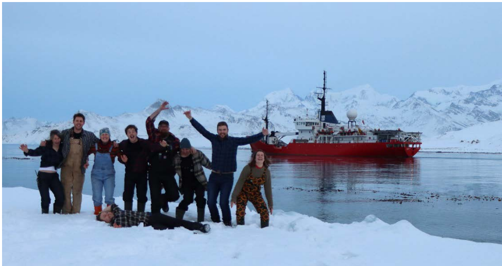
2024 Winter Team

There are usually a number of people who come in for the summer for various projects and the time on base varies. Some of these are BAS and some are from other organisations. They may have some time on base and some time in the field. They are usually accommodated in Discovery House and cook for themselves. Again, we usually extend an invitation to them for Saturday night dinners. Some people who come in for the summer have been down many times and have fascinating stories to tell of the island.