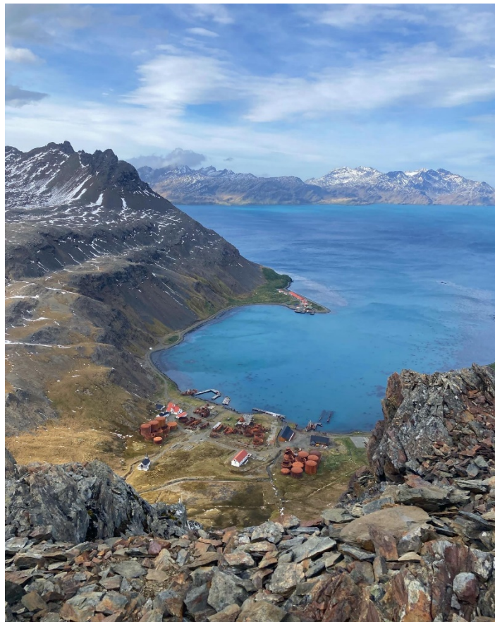
Looking down on Grytviken, in the foreground, and King Edward Point, in the distance, from Mt Orca