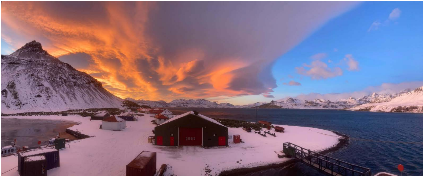
KEP "Main Street" viewed from on board a vessel. This will be where you arrive to.

KEP is different from the other British Antarctic Survey stations because it isn't just a BAS base. In fact BAS manage the station on behalf of South Georgia Government and that means that there are plenty of non-BAS people living and working here.