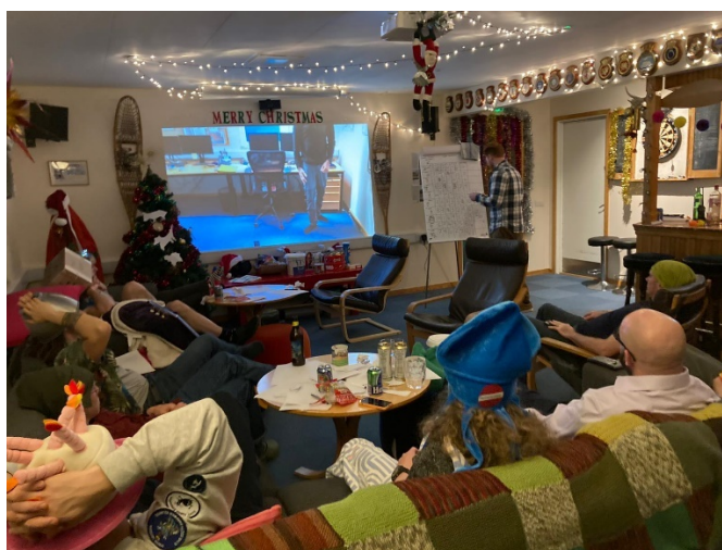
Social events in the Everson Bar/Living room